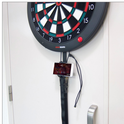
mounting on a dart belt