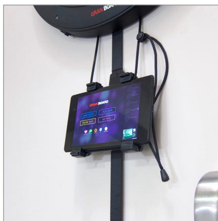
mounting on a dart belt