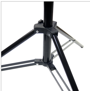
Center base design delivers incredible stability