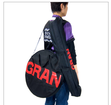
It goes very well with GRAN CARRY BAG (Sold Separately) for outdoor darts