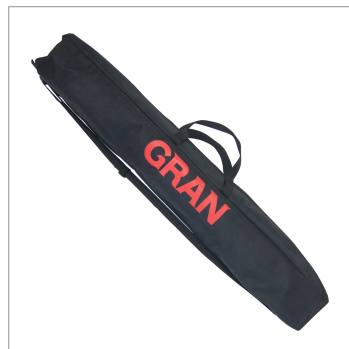
Comes with GRAN Logo printed original bag