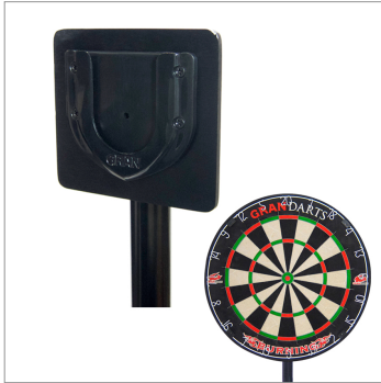
Universal designed GRAN Bracket is adopted. Compatible with various dartboards.